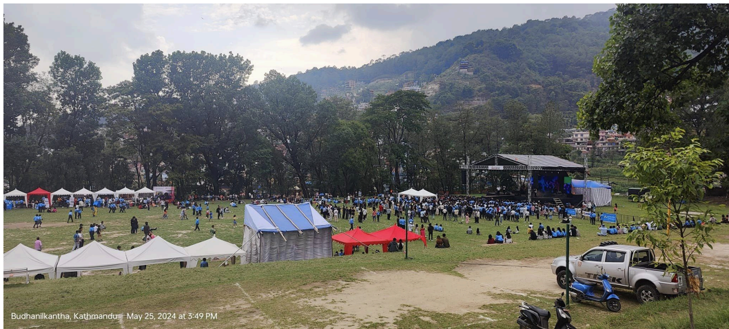
Budhanilkantha, Kathmandu May 25, 2024 at 3:49 PM